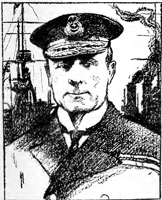
Sir John Jellicoe